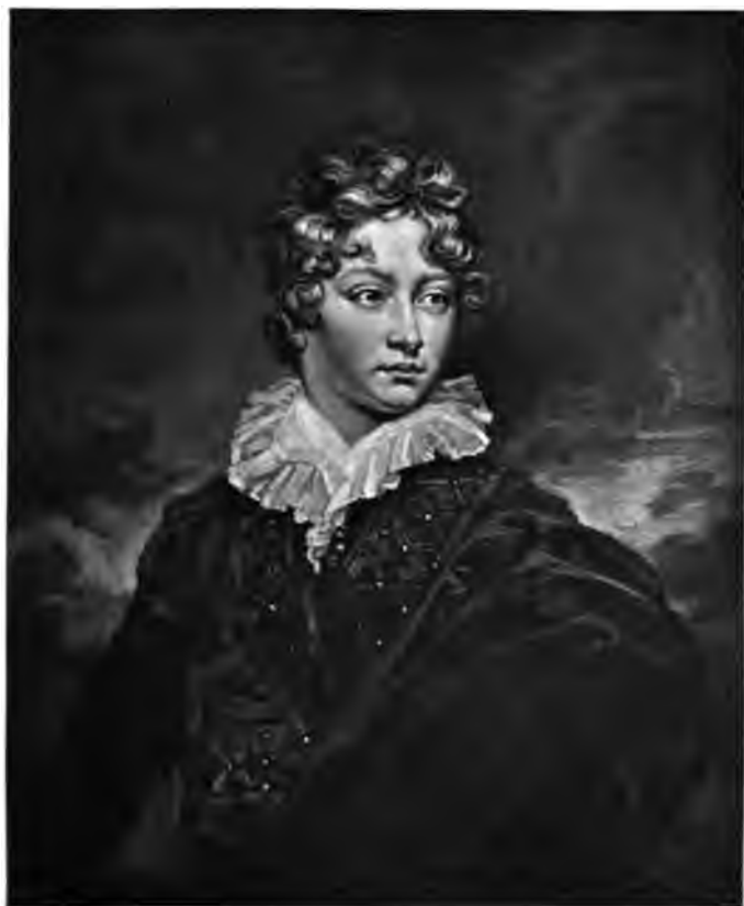
MASTER WILLIAM HENRY WEST BETTY, "THE YOUNG ROSCIUS" From an engraving by J. Ward after J. Northcote